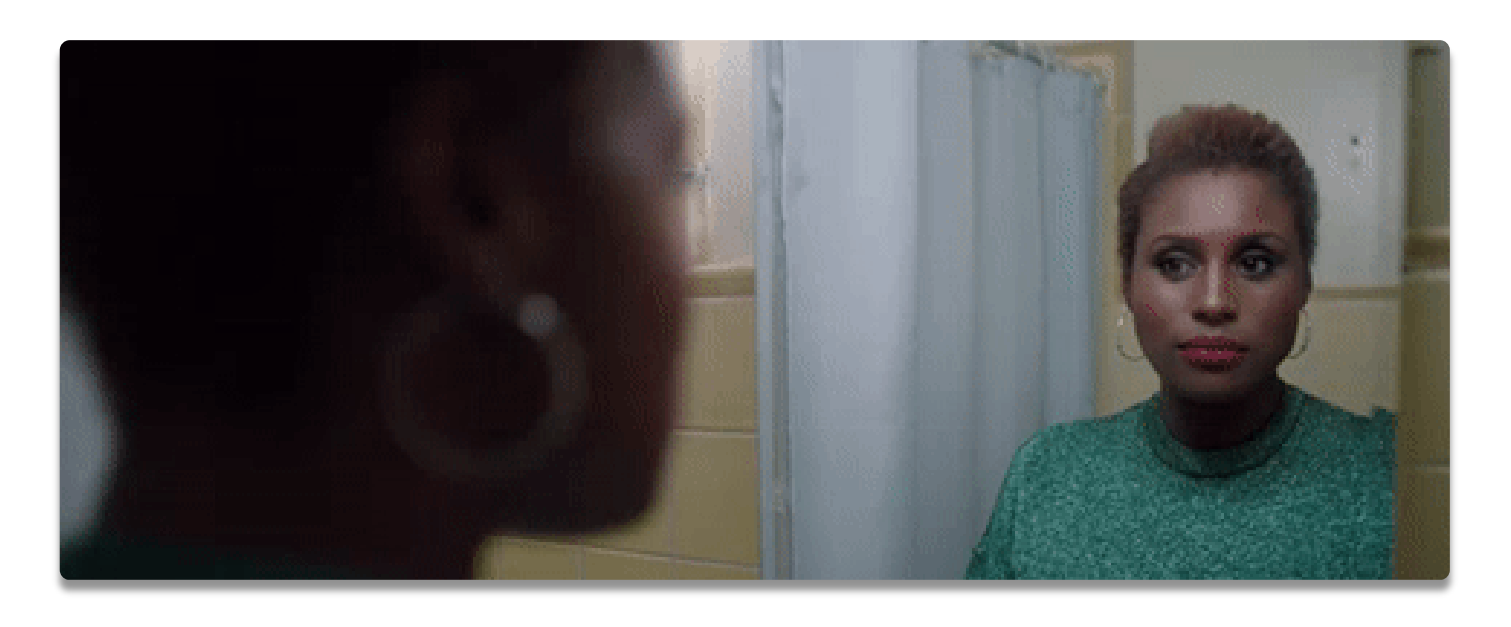
Say it to yourself- say it to others